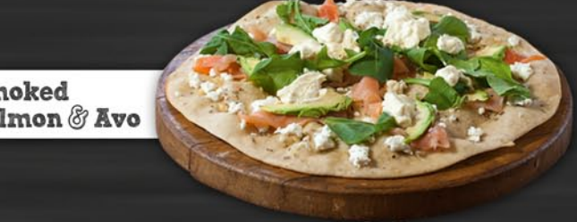
Smoked Salmon & Avo